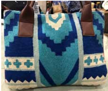
Sasha Sample for Crewel Reference